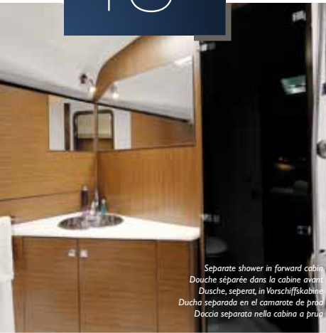
Separate shower in forward cabin Douche séparée dans la cabine avant Dusche, separat, in Vorschiffskabine Ducha separada en el camarote de proa Daccia separata nella cabina a prua