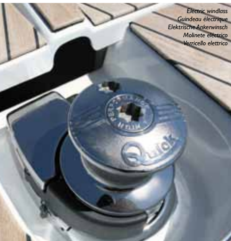
Electric windlass Guindeau électrique Elektrische Ankerwinch Molinete eléctrica Verricello elettrico