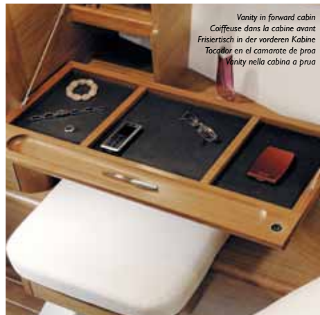
Vanity in forward cabin Coiffeuse dans la cabine avant Frisiertisch in der vorderen Kabine Tocador en el camarote de proa Vanity nella cabina a prua