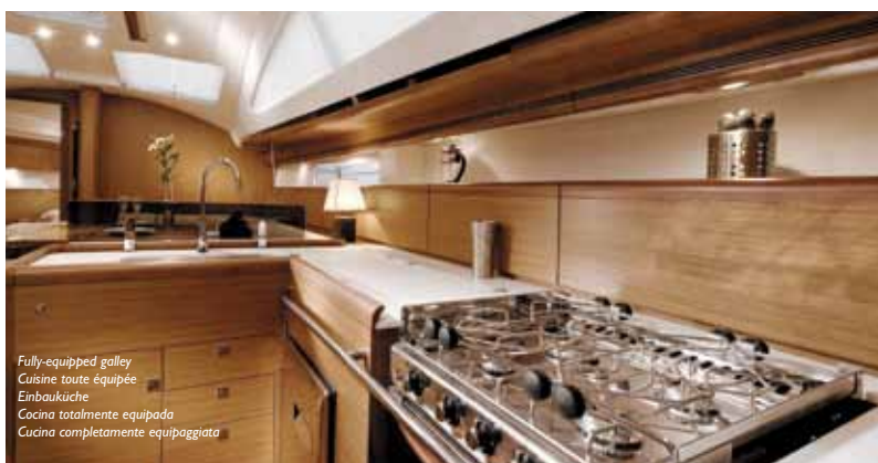
Fully-equipped galley Cuisine toute équipée Einbauküche Cocina totalmente equipada Cucina completamente equipaggiata